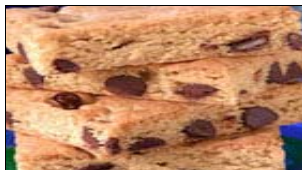
The 1- Minute Chef Blonde Brownies